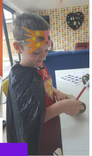
Cubs Assemble Online!

We are proud of all the young people and Network members that have achieved Top Awards this year and we look forward to welcoming you to a celebration evening in the future!