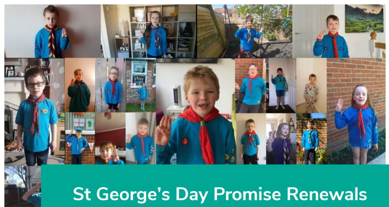
St George's Day Promise Renewals